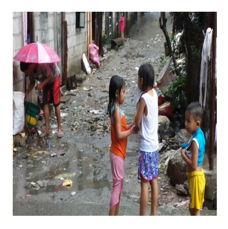
Food, Fun, and Fellowship