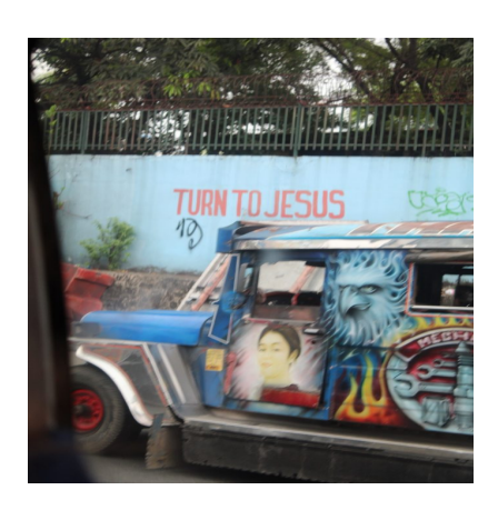
Starting with a blast!