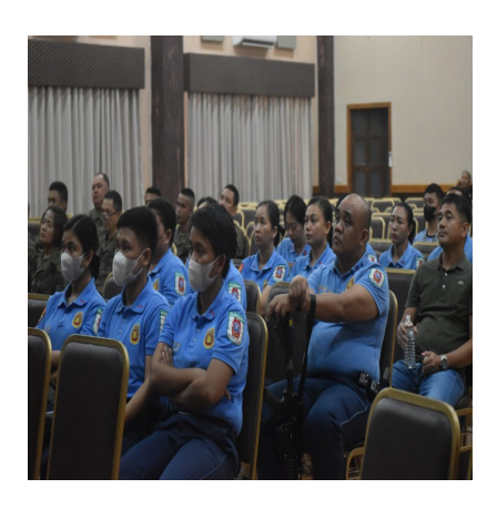
A Run-in with the Police