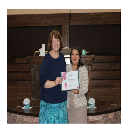
Ladies Day at SBBC